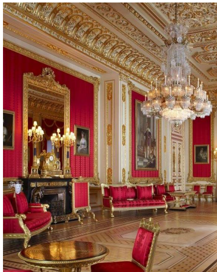
The Crimson Drawing Room at Windsor Castle

This iconic attraction has to be top of your must-visit list. Time your visit so that you can catch the changing of the guard ceremony that takes place in Lower Ward. This is the only place outside London where you can see this colourful display whilst listening to the military band.