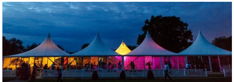
Royal Windsor Racecourse

Book a party at Royal Windsor Racecourse for your own event – catch a river taxi from central Windsor to the racecourse and stage your own celebration or dinner in an indoor or outdoor space depending on the season. The team at Windsor Racecourse can help you source entertainers, caterers and more to suit your event.