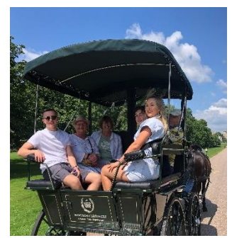
Windsor Carriage rides