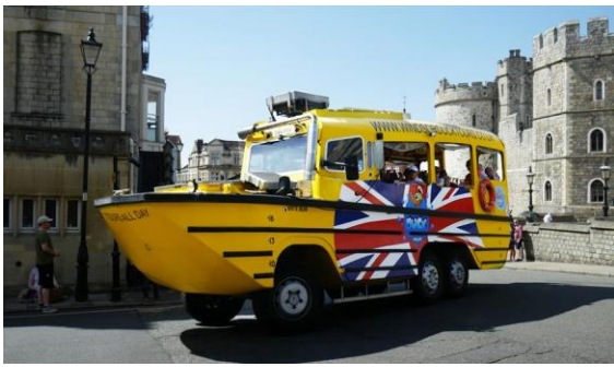
Windsor Duck Tours