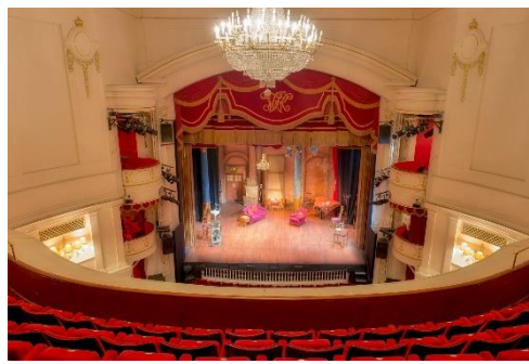
Theatre Royal Windsor