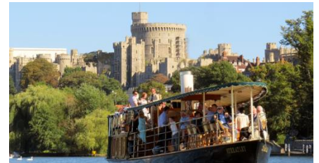
French Brothers boat cruises